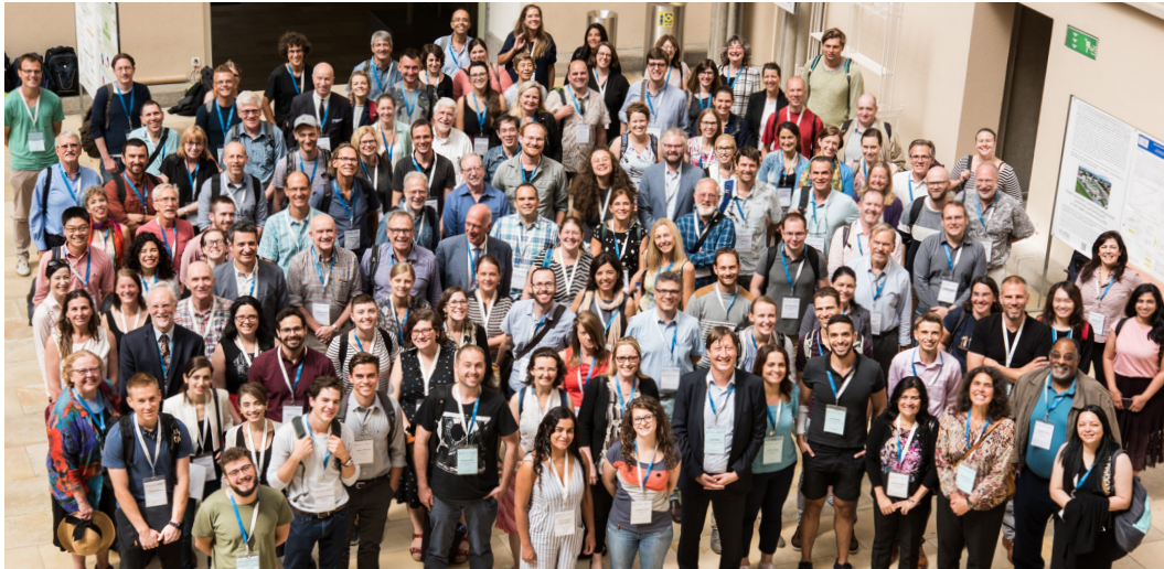
Conference group picture